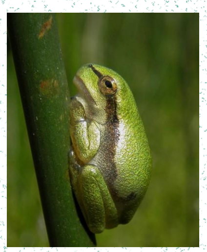
European tree frog (Hyla arborea)

Very simple thing you can do to save endangered species – Get to Know Them!