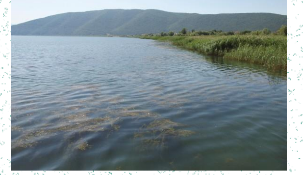
3150 – Natural eutrophic lakes with Magnopotamion or Hydrocharition

Aquatic ecosystems are natural habitats of many microorganisms, invertebrates, insects, mosses, fish, plants and mammals. Get familiar with the typical habitats in and around Prespa Lake!