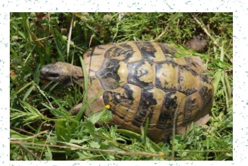
Hermann's Tortoise - Testudo hermanni

For the maintenance of a favourable status of the nature values – habitats and species – water quality of Prespa Lake is an important factor.