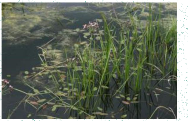
3260 – Water courses of plain to montane levels with the Ranunculion fluitantis and Callitricho-Batrachion vegetation