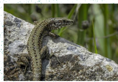
Common wall lizard - Podarcis muralis