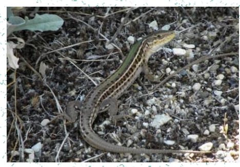
Balkan wall lizards - Podarcis tauricus

Did you know that some species are not typical for our nature? They are native to other countries, or even other continents. They are not part of the natural values of our country, but become dominant over time, threatening the existence of the real values of habitats.