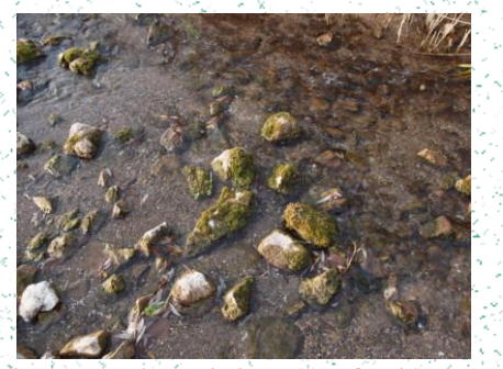
7220* - Petrifying springs with tufa formation (Cratoneurion)

Alluvial forests with Alnus glutinosa and (Fraxinus excelsior) (Alno-Padion, Alnion incanae, Salicion albae)