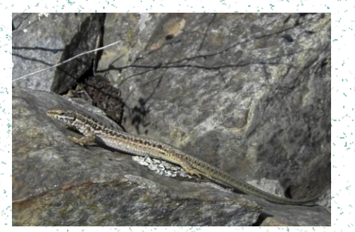
Erhard's wall lizard - Podarcis erhardi